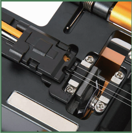
Universal Fiber Holder