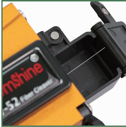
High Capacity Waste Bin