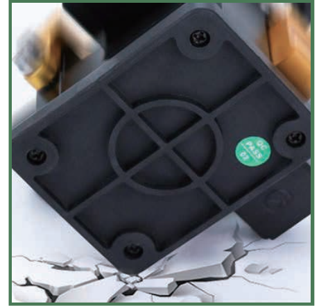
Rubber Armor Protection